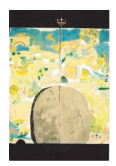
"The Quiet of the Tomb"