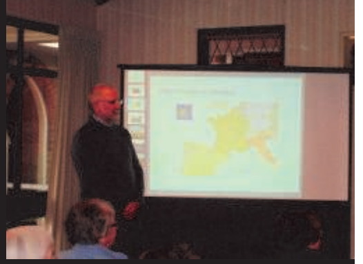
... where the Bishop talked of recently walking the Santiago de Compostela