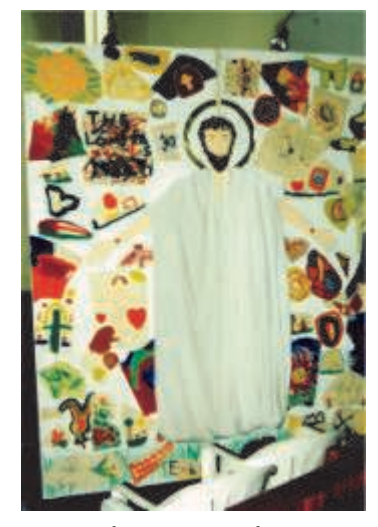
"The Resurrection"